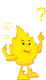
1. Myself, My World