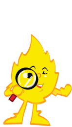
2. Learning to live together