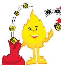
3. Money and Resources